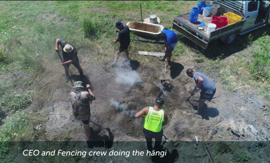
CEO and Fencing crew doing the hāngī