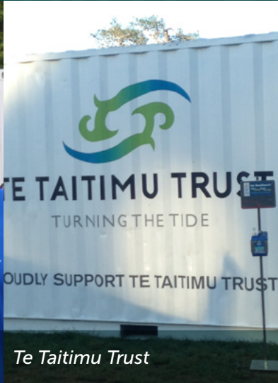
Te Taitimu Trust