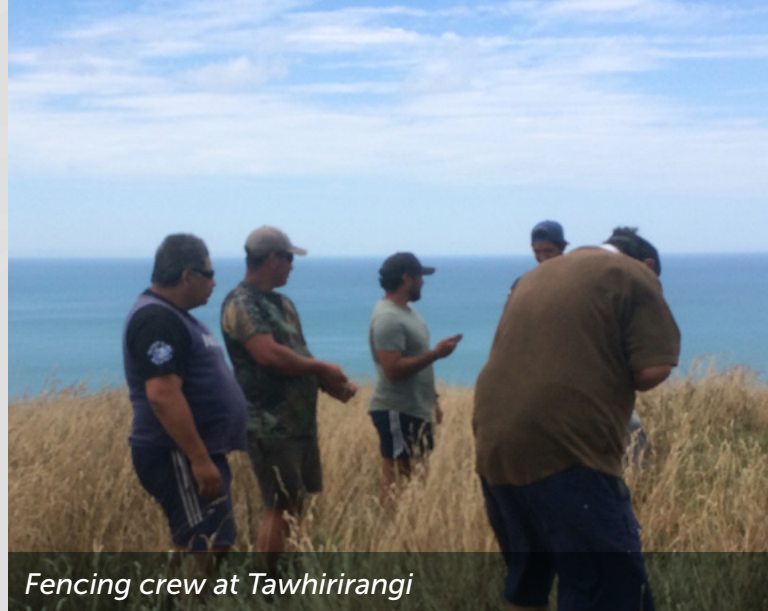
Fencing crew at Tawhirirangi

The team of seven work across the five farms, Te Otane (Sims Road) and various member owned lease blocks. There is a bit of logistics involved as currently the team are spread out across various properties. Working with Graeme