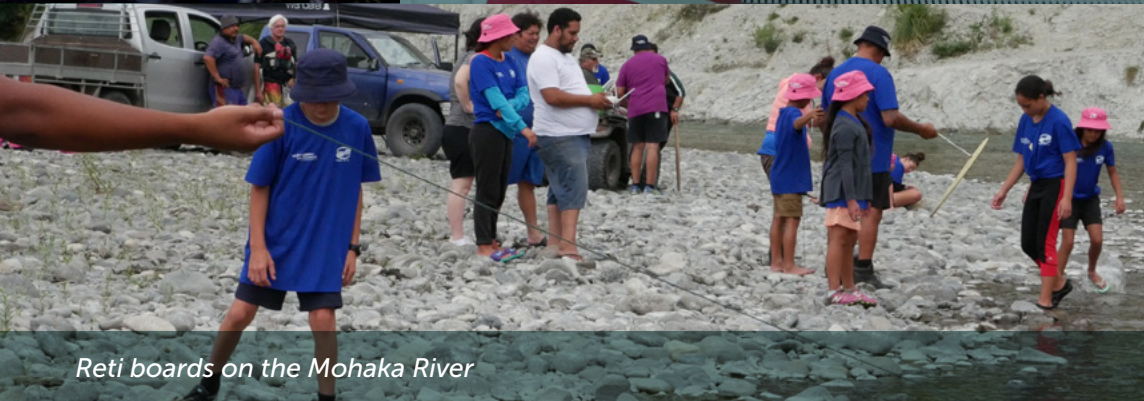
Reti boards on the Mohaka River