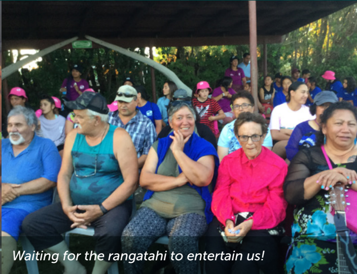
Waiting for the rangatahi to entertain us!