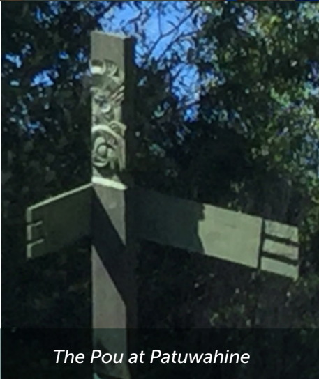
The Pou at Patuwahine