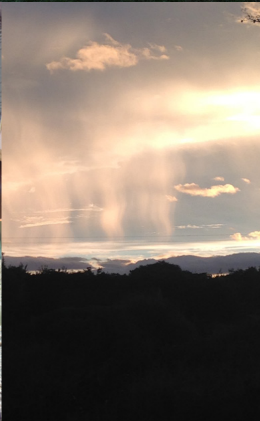
Beautiful sunrise at Mohaka