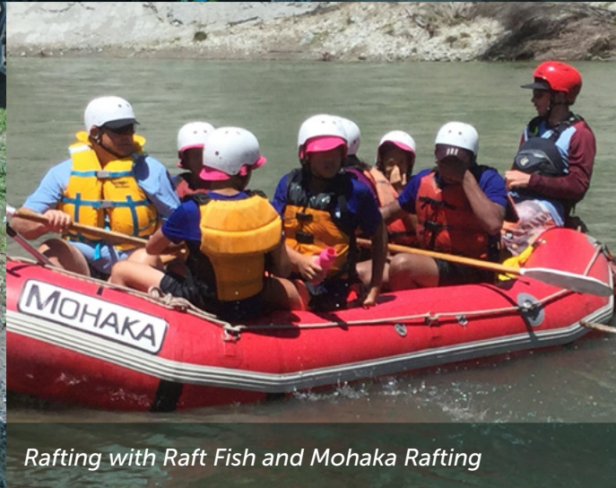
Rafting with Raft Fish and Mohaka Rafting