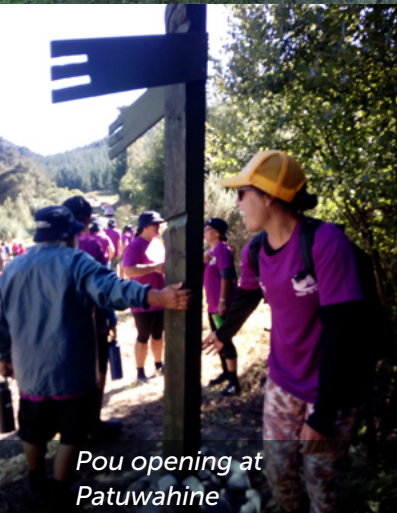
Pou opening at Patuwahine