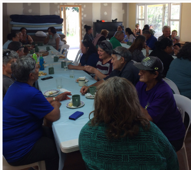
Above & below: Hikoi Tutuki Ki Pahauwera

The Pāhauwera hikoi was attended by over 40 people who visited the Putere Marae, Putere Lakes, Rawhiti Station and Mohaka Marae listening to historical, cultural, environmental and community korero.