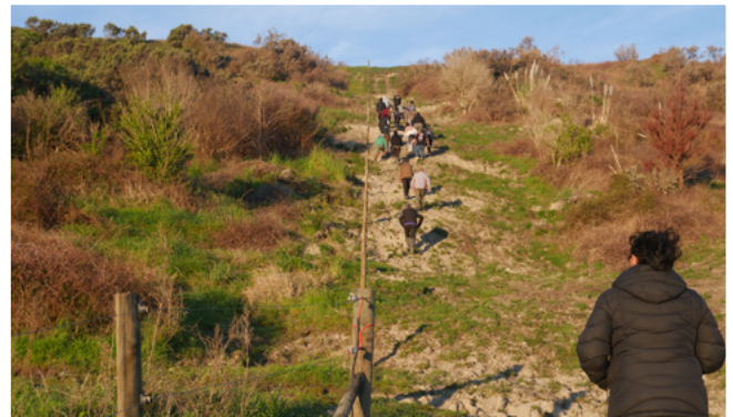
Above: Rangatahi hikoī up Tawhirirangi

For this 3 day course our rangatahi we able to achieve the following credits, once completed.