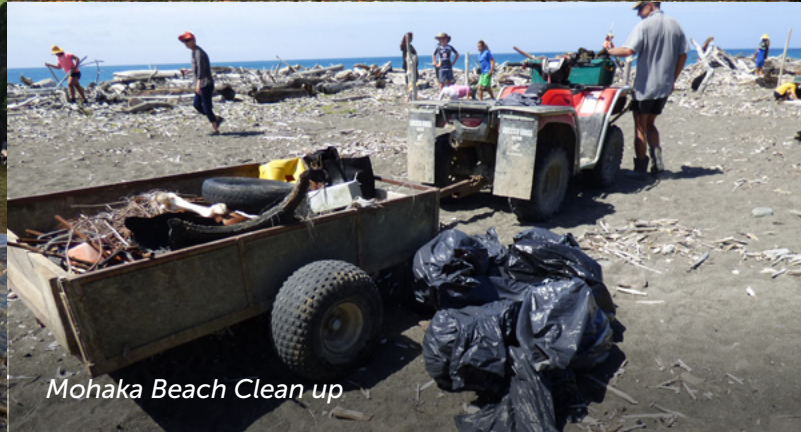
Mohaka Beach Clean up