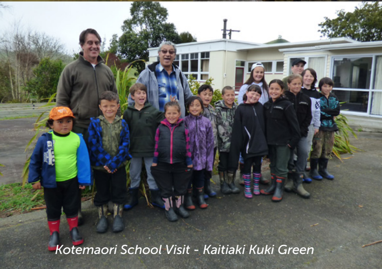
Kotemaori School Visit - Kaitiaki Kuki Green