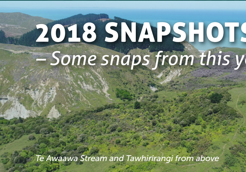
Te Awaawa Stream and Tawhirirangi from above