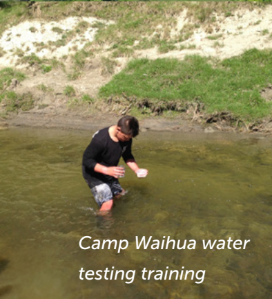
Camp Waihua water testing training