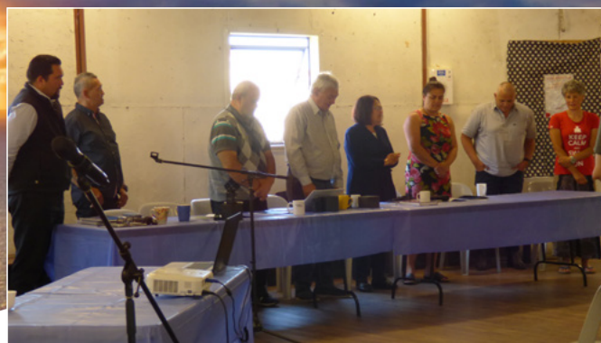
Above: Trustees at the AGM