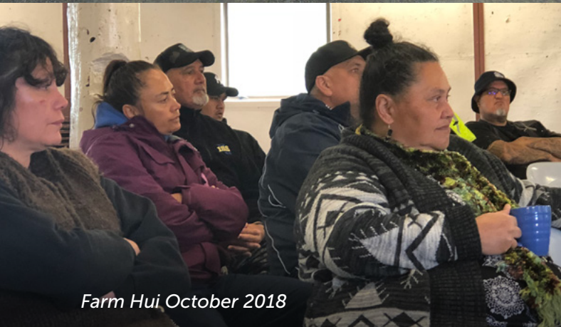
Farm Hui October 2018