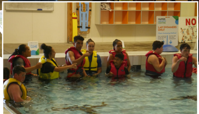
Above: Rangatahi at the Water Safety Course