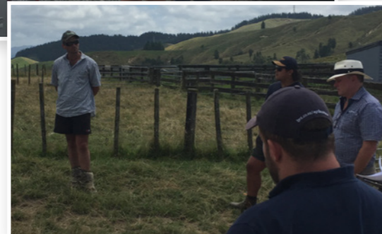
Images: Farm judging taking place.

Parliamentary announcement on 21-February with the winner announced in Gisborne on 24-May.