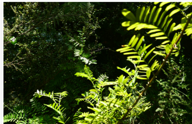
Above: Te Heru o Tureia - Ngutu Kaka thriving Below: Te Heru o Tureia - Bluffs