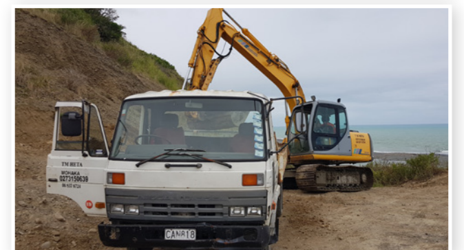
Image 1: Te Awaawa Stream catchment Image 2: Charlie and Kuki Image 3: Gnarly terrain Image 4: Tom Heta