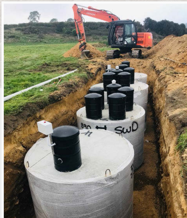
Making progress – septic tanks are in the ground

Right: Two of the Papakainga homes Raupunga.