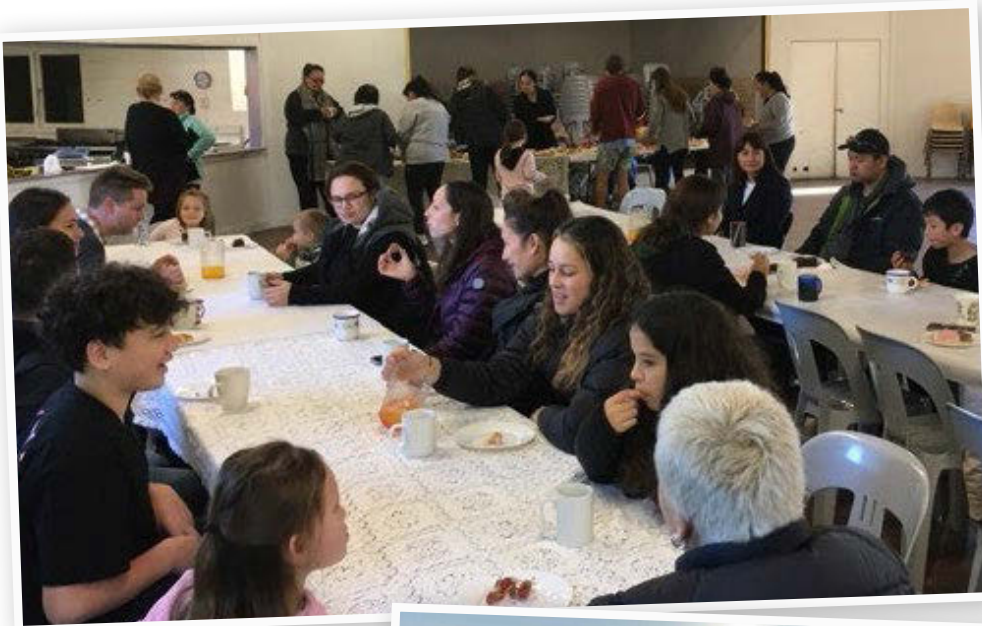
Left: Gemmell Whānau inside Rongomaiwahine Mōhaka Marae