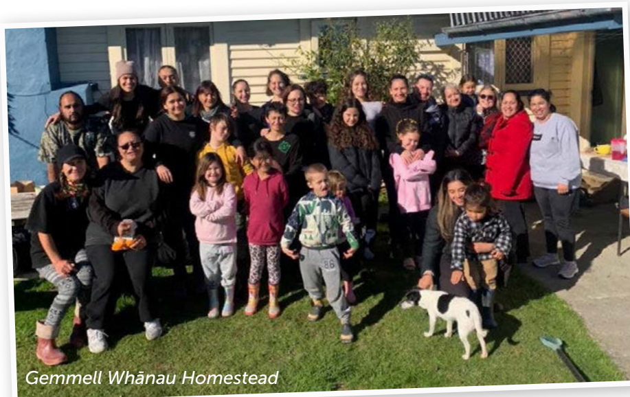
Gemmell Whānau Homestead