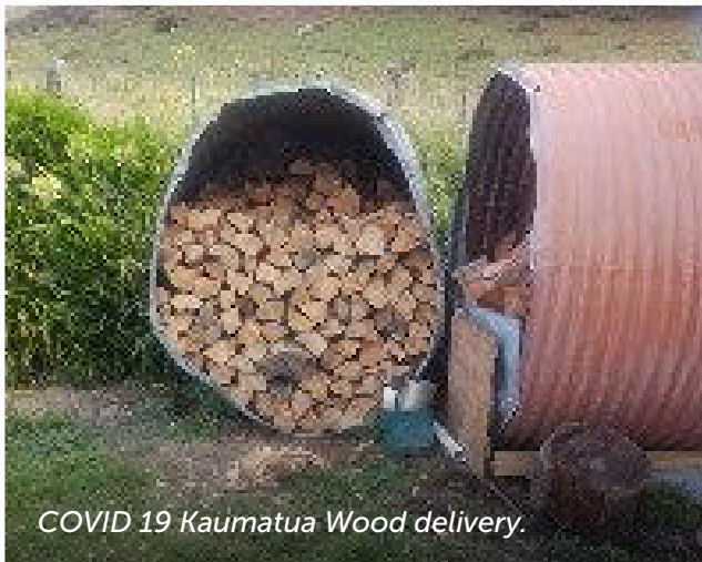
COVID 19 Kaumatua Wood delivery.

During Level 4 lockdown, one of my major jobs was to find out whānau medical needs. From the information that I was given I was able to create a database of our whānau.