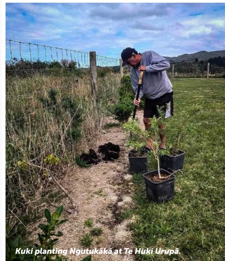
Kuki planting Ngutukākā at Te Hūki Urupā.

When the site was revisited in March 2024, no ngutukākā seedlings were visible. Another inspection in September 2024 revealed a live billy goat had managed to enter the enclosure from above, stripping the area bare of vegetation and seedlings before escaping as the team approached.