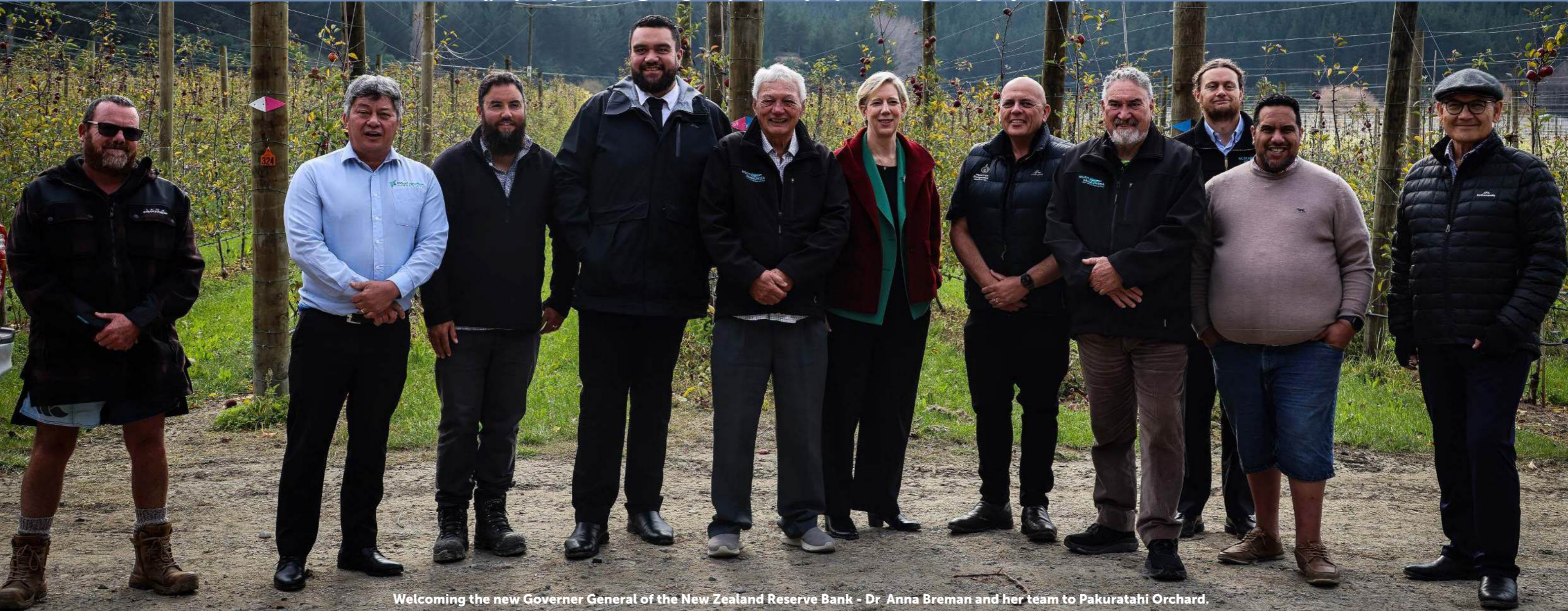
Welcoming the new Governor General of the New Zealand Reserve Bank - Dr Anna Breman and her team to Pakuratahi Orchard.