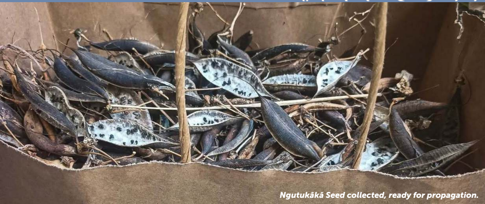
Ngutukākā Seed collected, ready for propagation.