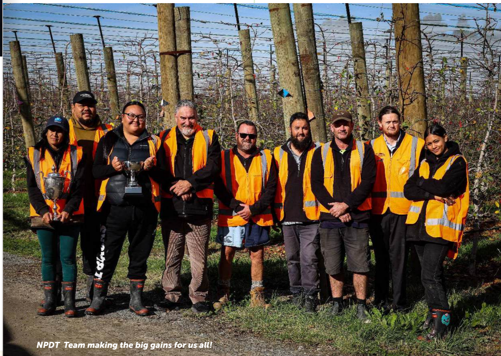
NPDT Team making the big gains for us all!

We also look forward to supporting our whānau at the upcoming Ahuwhenua Awards in Whangārei. Events like these are an opportunity to celebrate excellence across Māori agribusiness and acknowledge the many people working hard to grow strong futures for our whenua and communities. Best wishes to all finalists and participants, we know our people will do us proud.