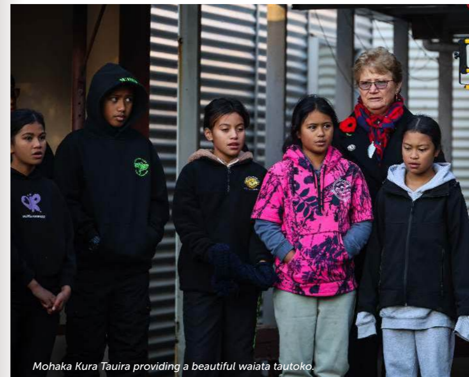
Mohaka Kura Taurira providing a beautiful waiata tautoko.

This is an incredibly important piece of storytelling that highlights not only the impact these events had on our country, but also the lasting effect on whānau and descendants who continue to carry these histories today.