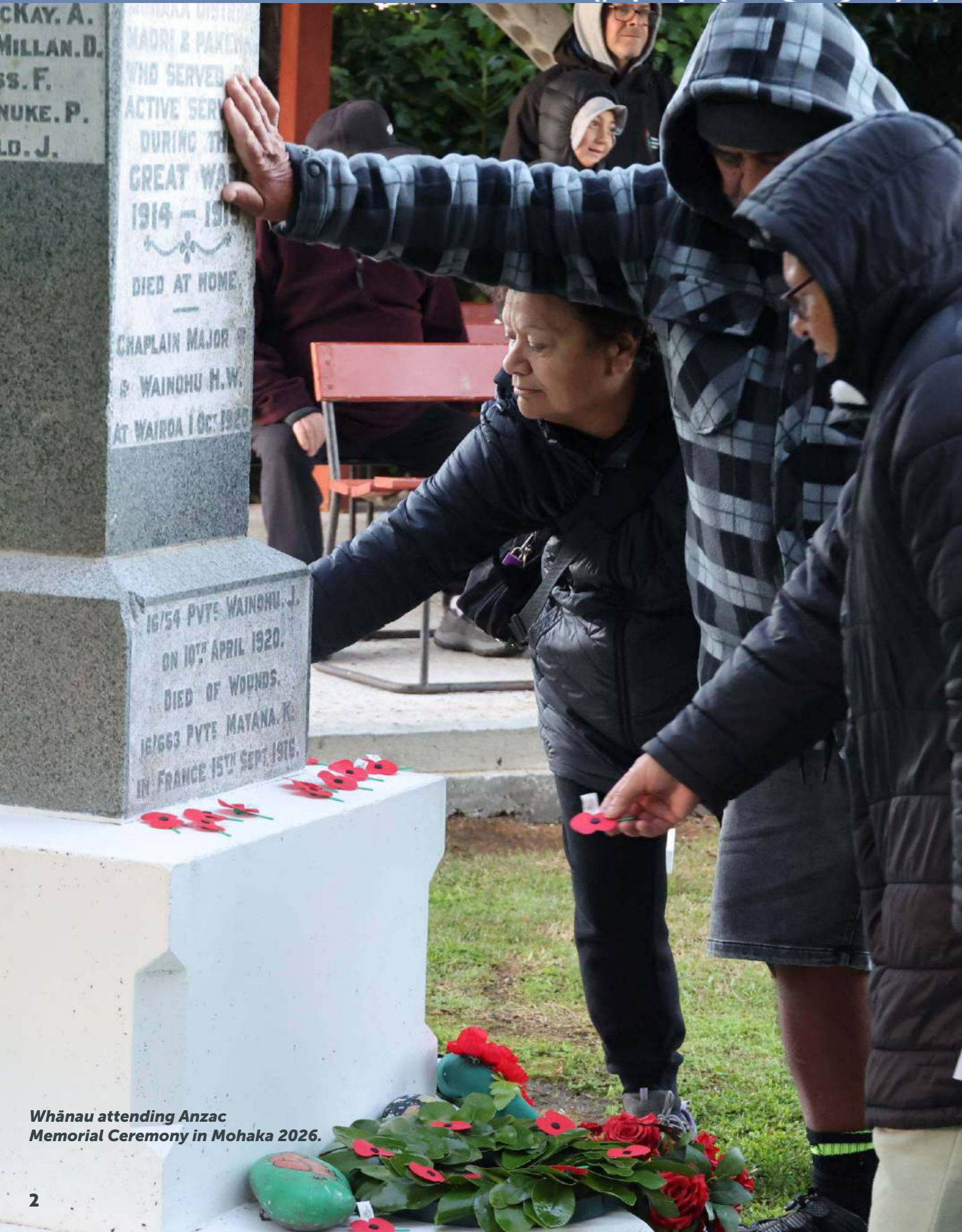
Whānau attending Anzac Memorial Ceremony in Mohaka 2026.