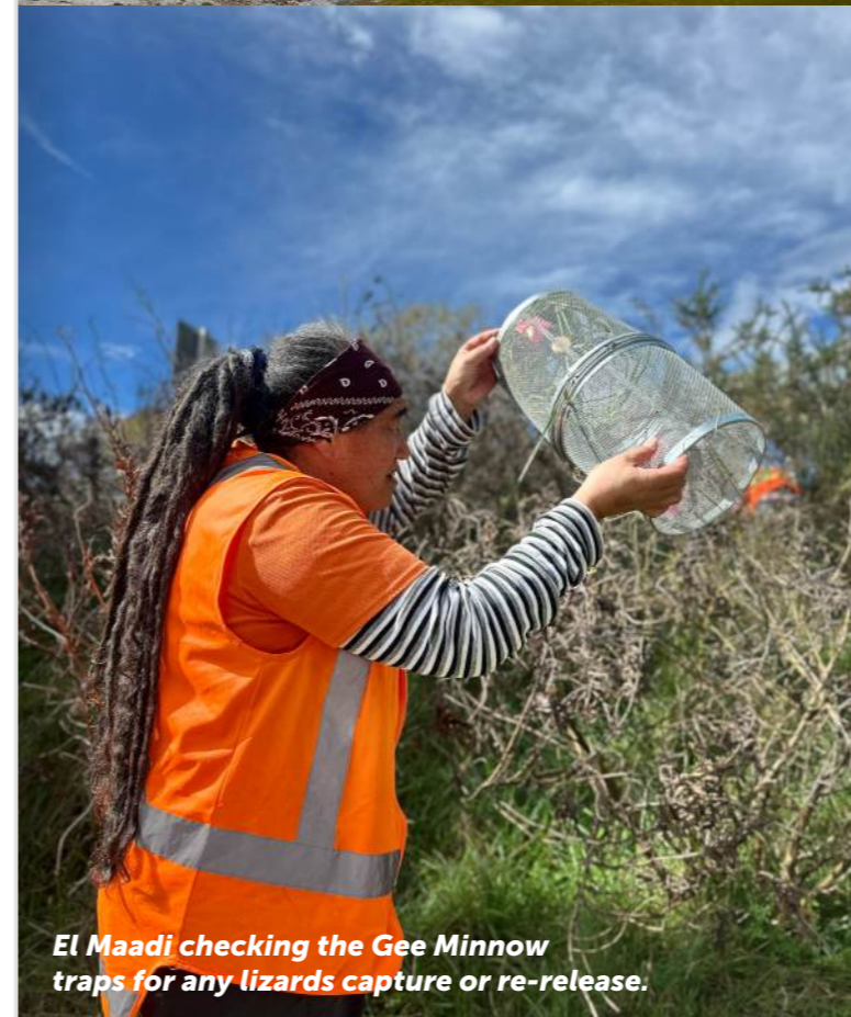
El Maadi checking the Gee Minnow traps for any lizards capture or re-release.