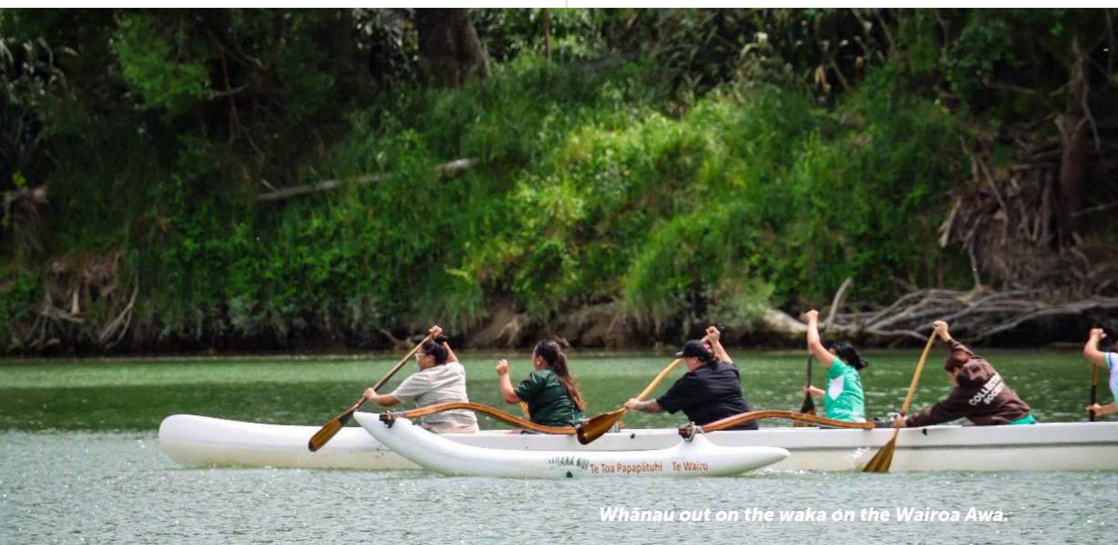
Whānau out on the waka on the Wairoa Awa.

To stay connected and keep up to date with Trust news and activities, shareholders are encouraged to follow the 'Paroa Farm Trust Mohaka' Facebook page or visit the website at paroaformtrust.co.nz