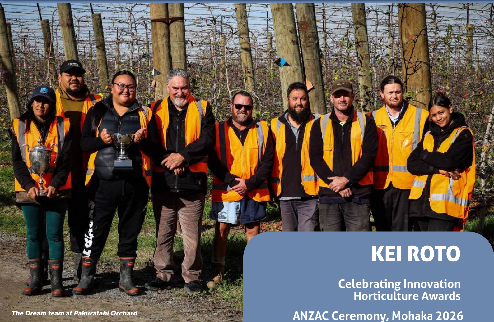
The Dream team at Pakuratahi Orchard

Ngāti Pāhauwera Development Group Newsletter