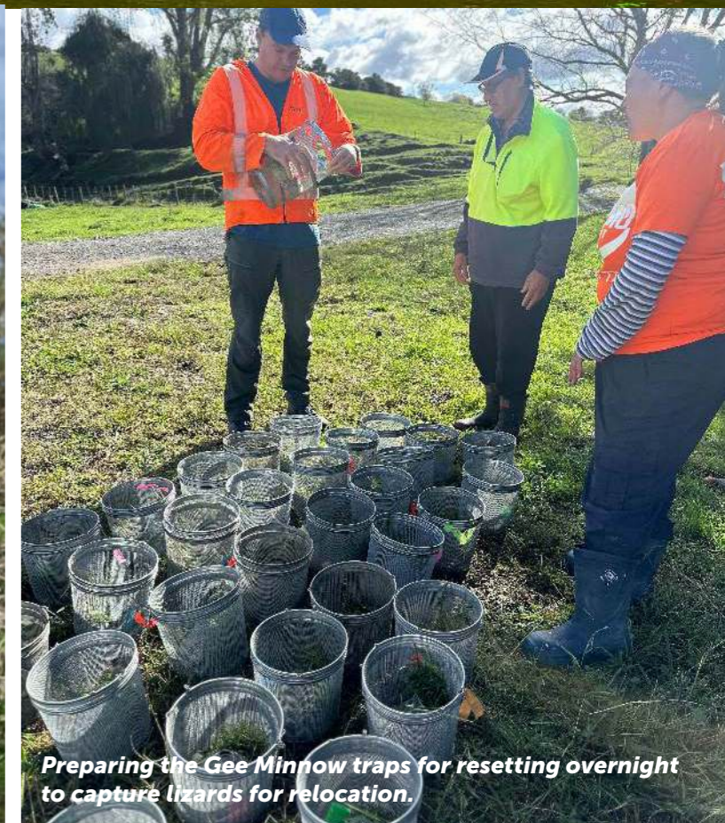
Preparing the Gee Minnow traps for resetting overnight to capture lizards for relocation.