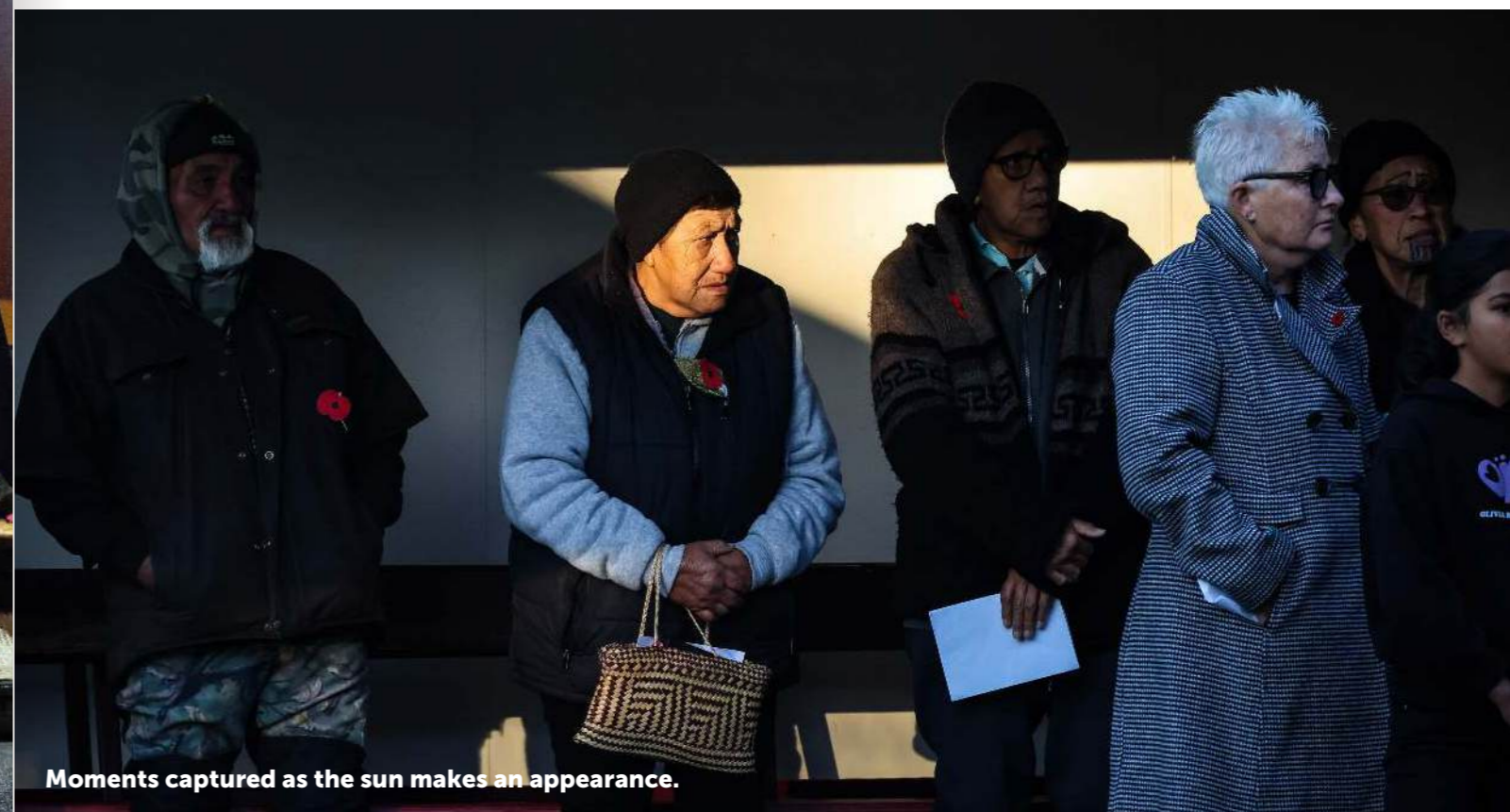
Moments captured as the sun makes an appearance.