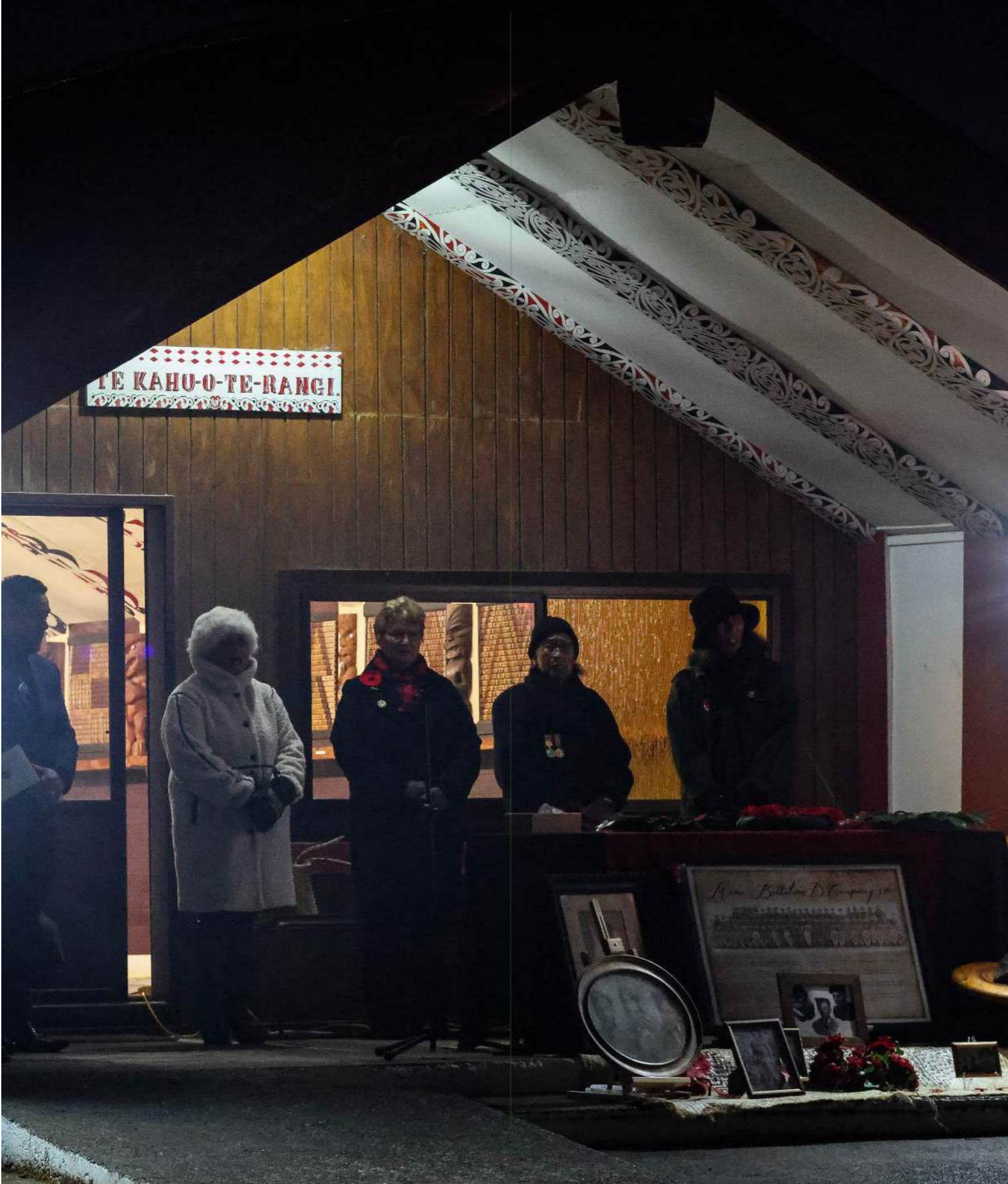
Moments captured during the ANZAC ceremony in Mohaka.