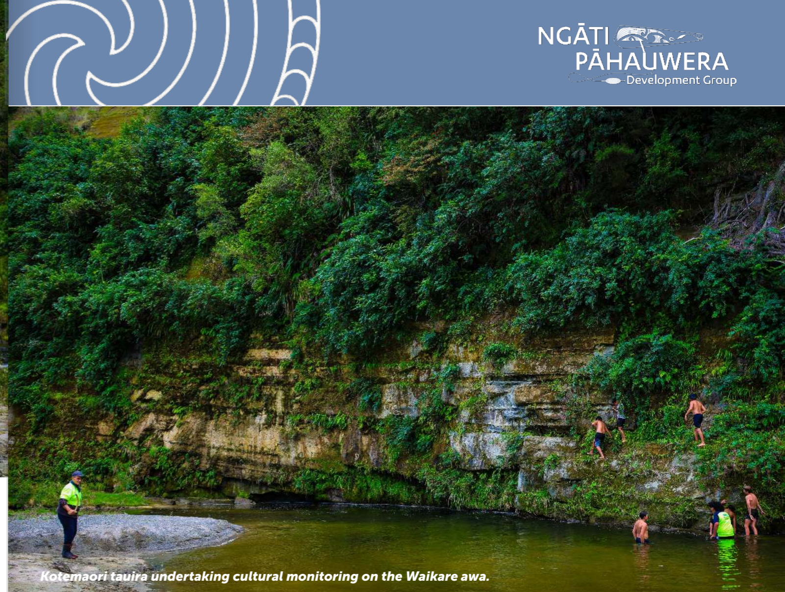
Kotemaori taura undertaking cultural monitoring on the Waikare awa.